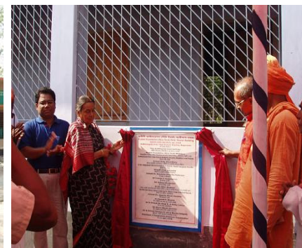
Welcome At Bhakta Palli School